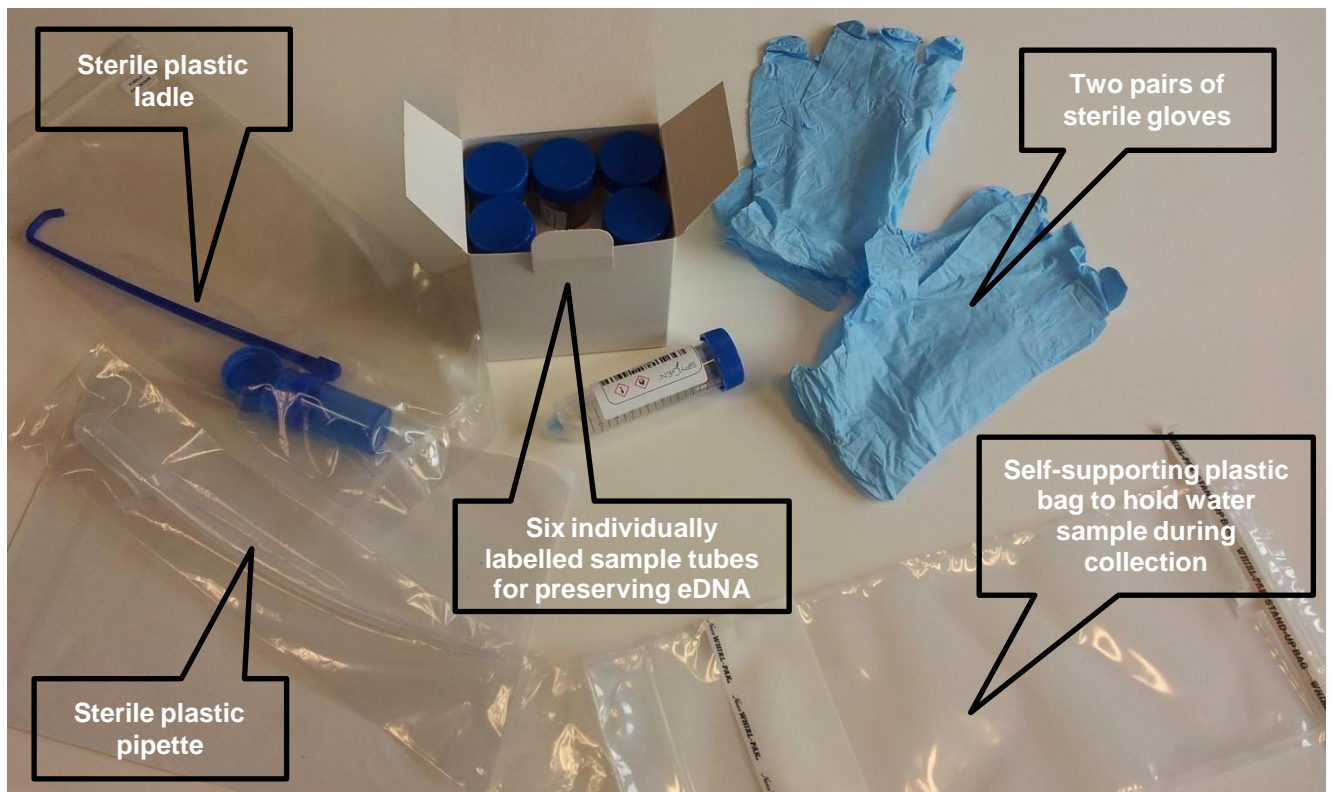
Figure 2 Sampling equipment used for eDNA water samples by Biggs et al. (2014)